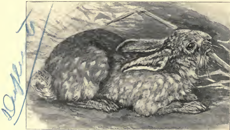
FIG. XL. LEPUS ALLENI . ALLEN'S JACK RABBIT.